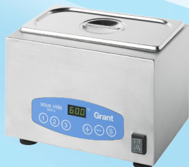
SVE 5 litre (1/3 Gastro)

Overall Dims: 230 x 335 x 220 mm Working Volume: 150 x 300 x 120 mm Heater Power: 0.35kW