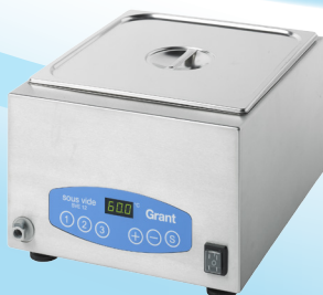
SVE 12 litre (2/3 Gastro)

Overall Dims: 430 x 335 x 240 mm Working Volume: 330 x 300 x 120 mm Heater Power: 0.7kW