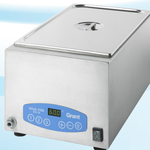
SVE 26 litre (1/1 Gastro)

Overall Dims: 585 x 325 x 275 mm Working Volume: 505 x 300 x 190 mm Heater Power: 1.4kW