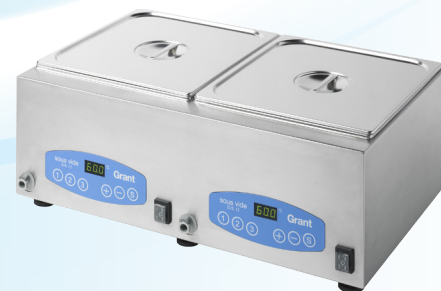
SVE 12 Dual litre (2/3 Gastro) x 2

Overall Dims: 430 x 660 x 240 mm Working Volume: 330 x 300 x 120 mm Heater Power: 1.4kW